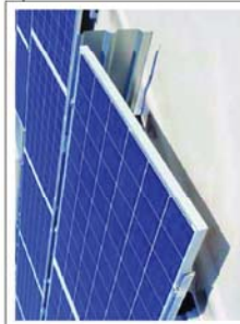
Photovoltaic Panels To Low Level Roof