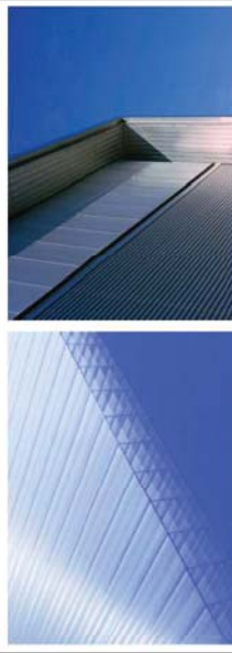
Vertical Panels To Hangar Doors Translucent Polycarbonate In Natural Anodised Aluminium Frame