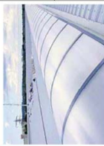
Rooflights To Low Level Roof Translucent Polycarbonate In PPC Aluminium Frame