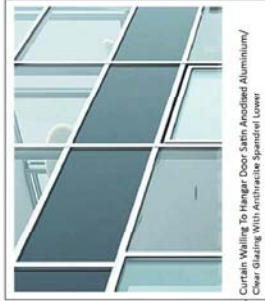
Curtain Walling To Hangar Door Satin Anodised Aluminium/ Clear Glazing With Inhibitive Sputtered Lower