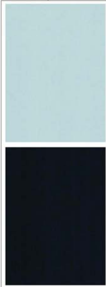
Light Grey (Sarnelli 9525) And Dark Grey (Sarnelli 9500) Roof Membrane Contrasting Colour Coded To Adjacent Cladding With Contrasting Walkway To Roofs