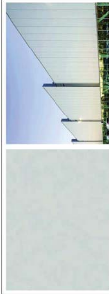
Light Cladding Type 2 BA_7035