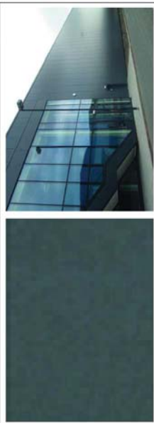
Dark Cladding type 1 RAL 7016